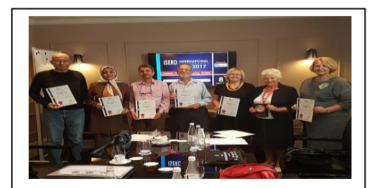
Saint Petersburg, Russia ,8th August, 2017