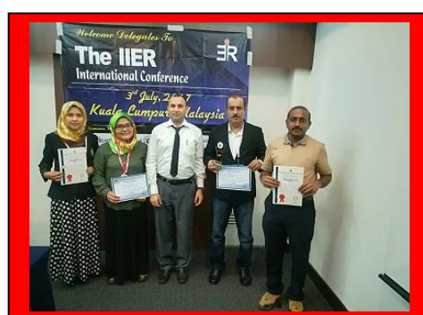
Kuala lumpur Malaysia ,3rd July 2017

With the help of various Universities and Institutions worldwide Pet has organized various seminars, conferences an workshops. Where thousands of participants have attended the conference and seminars. The seminars and in collaboration with different universities. Some the seminars happened during 2015 and 2016 at various Places like Canada, Sweden, China, Istanbul, Bangkok, Japan, USA, UK,