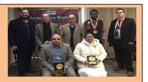
Toronto, Canada, 5th March 2016