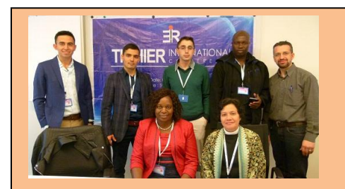
Stockholm, Sweden, 2nd April 2016